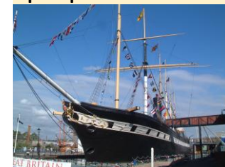
SS Great Britain

Classify- To sort or arrange things into groups depending on their properties.