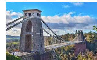
Clifton Suspension Bridge